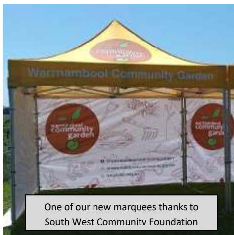
One of our new marquees thanks to South West Community Foundation