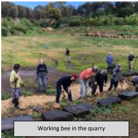
Working bee in the quarry