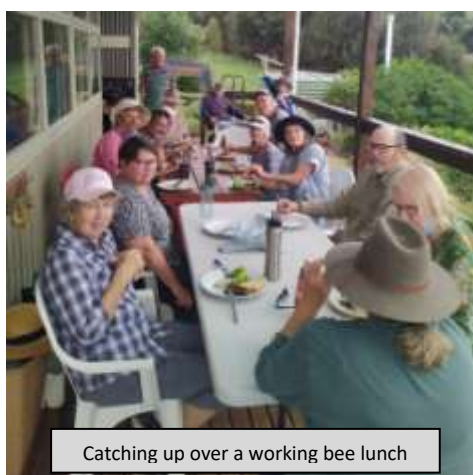
Catching up over a working bee lunch

mowing and edging, and do most of the structural repair and development work. Our Saturday Communal Sessions generally result in another 100+ hours of similar work per month. As amazing as these contributions may be, don't get too focused on the hours of work. Paramount in all of this is that the work is undertaken with a sense of community – at heart we are an organisation for people and the garden is the focus we use to bring us together.